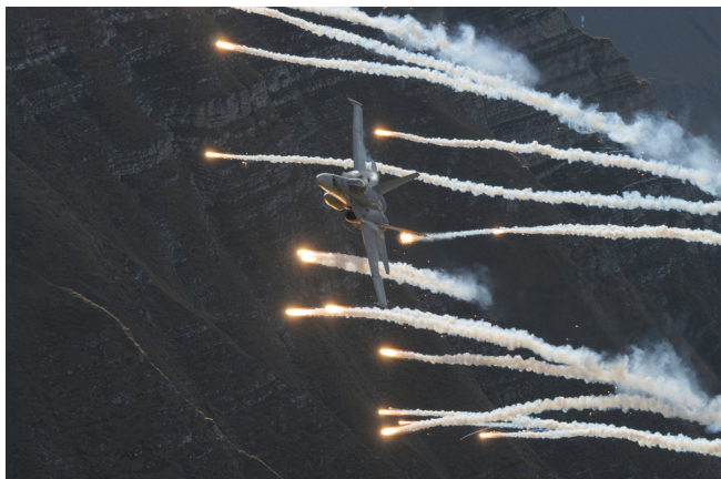
& taken at AXALP 2010

Of course, everything depends on the weather and this can change in the mountains with very little warning despite what the forecast might be. However, the Swiss Met people seem to get it right most times and Axalp has only been completely cancelled, i.e., every day, on very few occasions; it is definitely worth the taking the risk. In 2009 and 2010 the weather forecast was good, allowing at least 1 practice day and a firepower demo day.